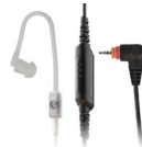
EARPIECE WITH LOUD AUDIO TRANSLUCENT TUBE 1-wire surveillance kit with translucent eartube and in-line PTT/microphone. UL intrinsically safe certified. PMLN8191